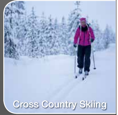
Cross Country Skiing

Live in our newly renovated and modern hotel rooms, wake up and eat breakfast with a fantastic view over Tjamstanbackarna. You can go downhill- or cross country skiing and have a great day outdoors enjoying the fresh air! When the evening comes you can have dinner in our restaurant Tallkotten and then relax in our sauna or outdoor Jacuzzi.